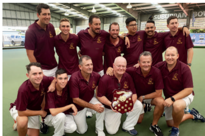
South Men - winners