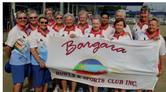
Division 1 Women Runners Up Bargara