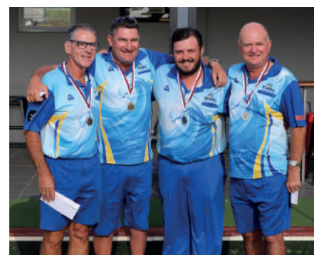
Fours Men - First Place Tweed Heads