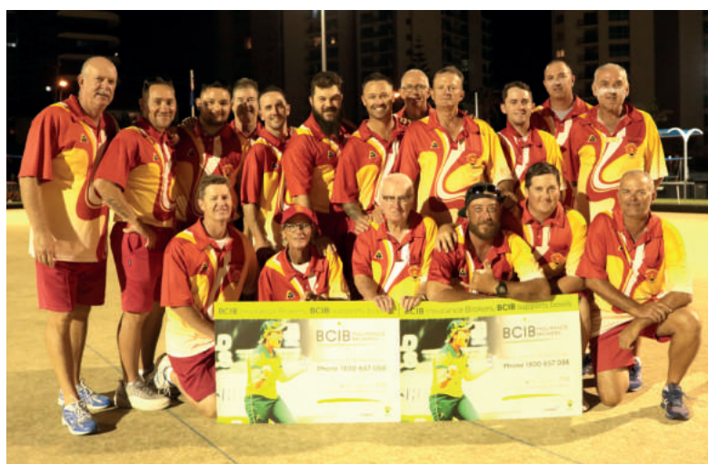
Division 1 Men Runners Up Brisbane