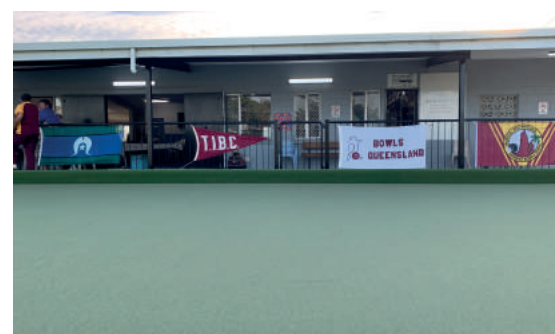
Thursdays Island green