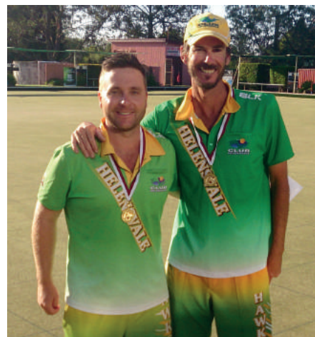
Pairs Men - First place Helensvale