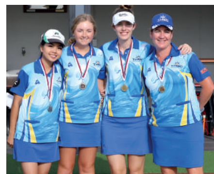
Fours Women - First place Tweed Heads