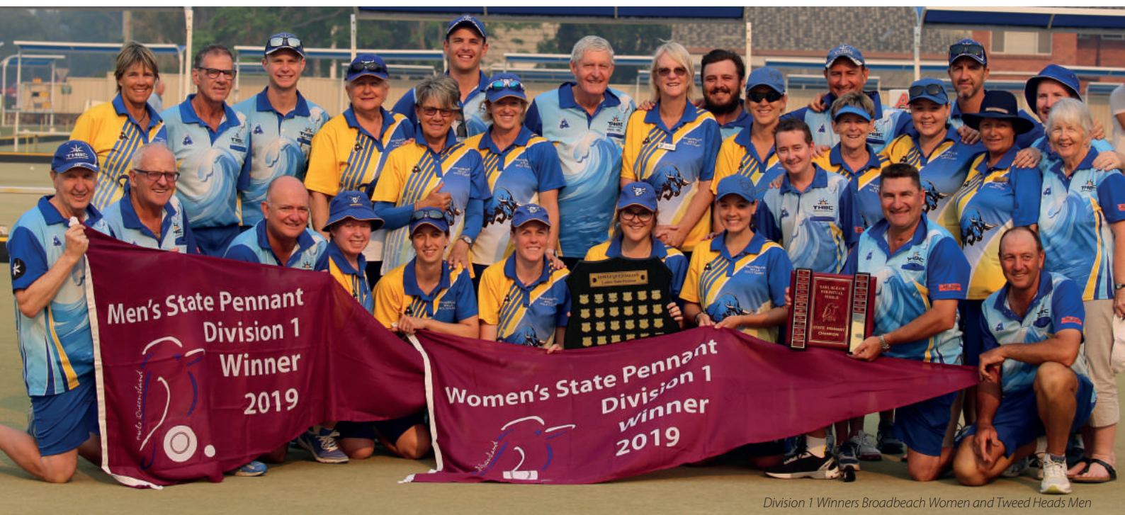
Division 1 Winners Broadbeach Women and Tweed Heads Men