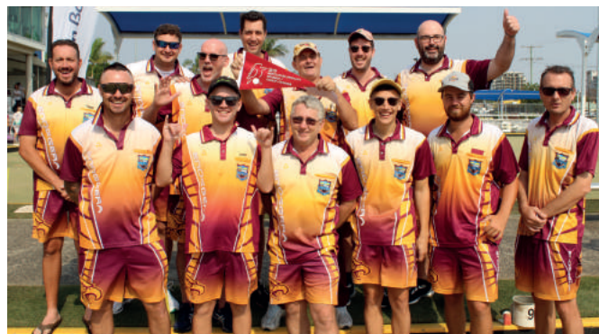
Division 1 Men Runners Up Enoggera