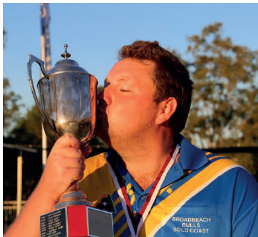
Men's Singles winner Kevin Anderson