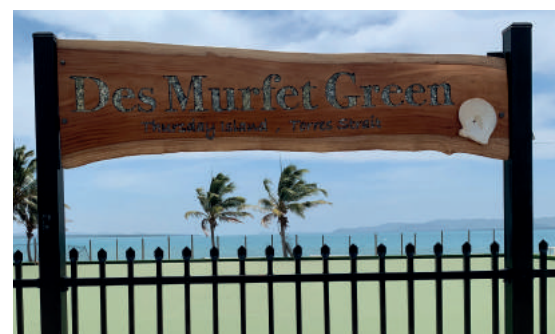
Opening of the Des Mufet Green - Thursdays Island