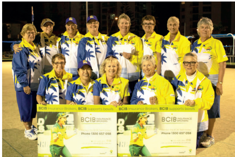
Division 1 Women Runners Up Sunshine Coast

Downs Port Curtis Leichhardt Maranoa/Warrego