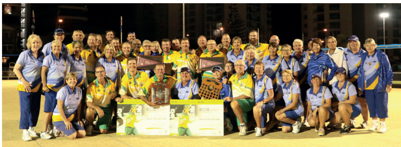
Division 1 Winners Gold Coast Tweed 'A' women and Gold Coast Tweed men