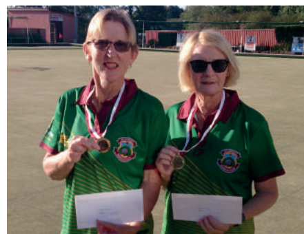
Pairs Women - First place Mt Gravatt