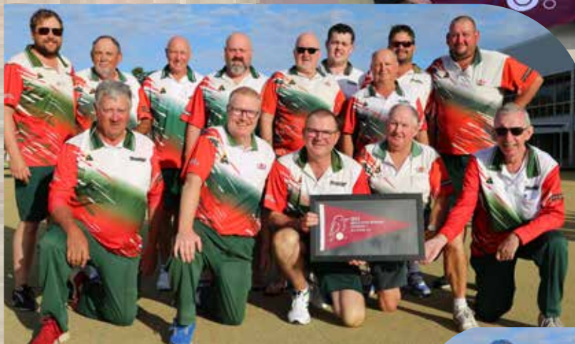
NORTH TOOWOOMBA BOWLS CLUB