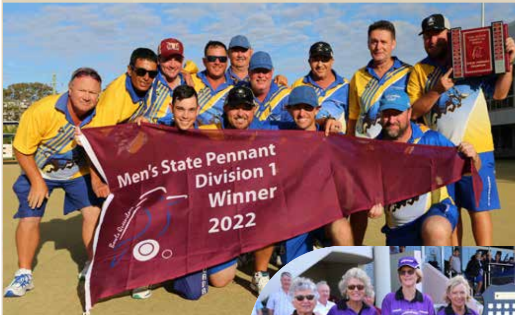
BROADBEACH BOWLS CLUB