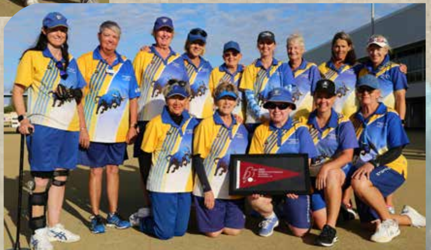
BROADBEACH BOWLS CLUB