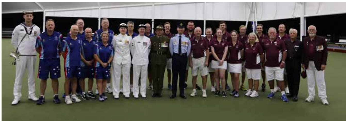
2023 ADF & Presidents XII Teams