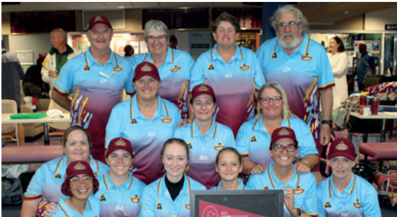
Runners-up Northern Suburbs Bowls Club women