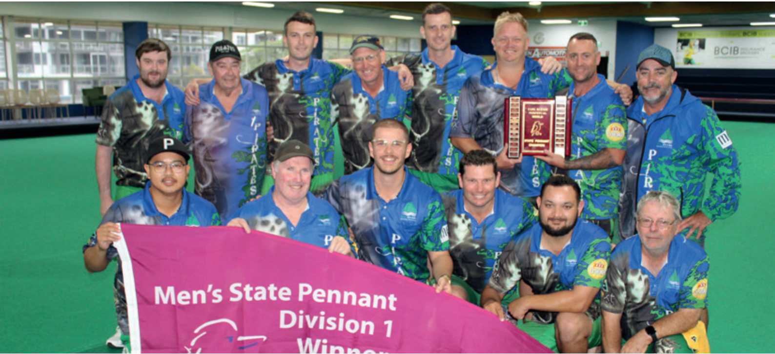
Pennant 2023 Division 1 Winners Club Pine Rivers men