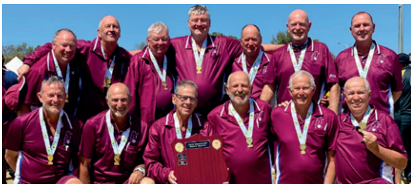
QLD Senior Sides Men