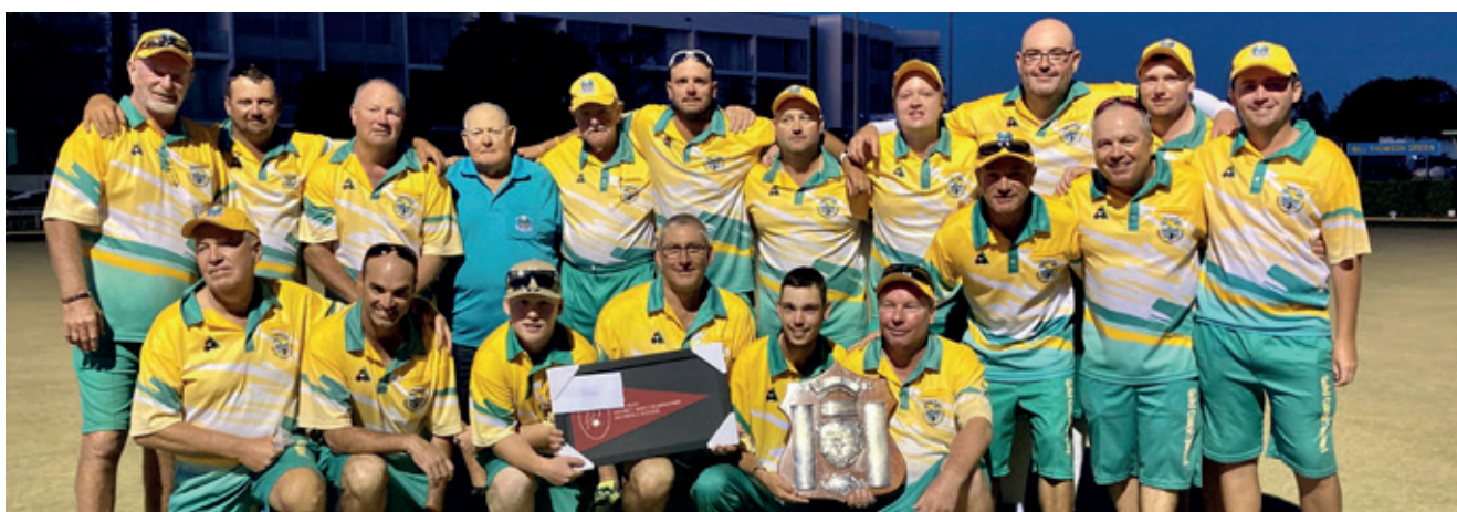
Division 1 Winners Gold Coast Tweed (men)