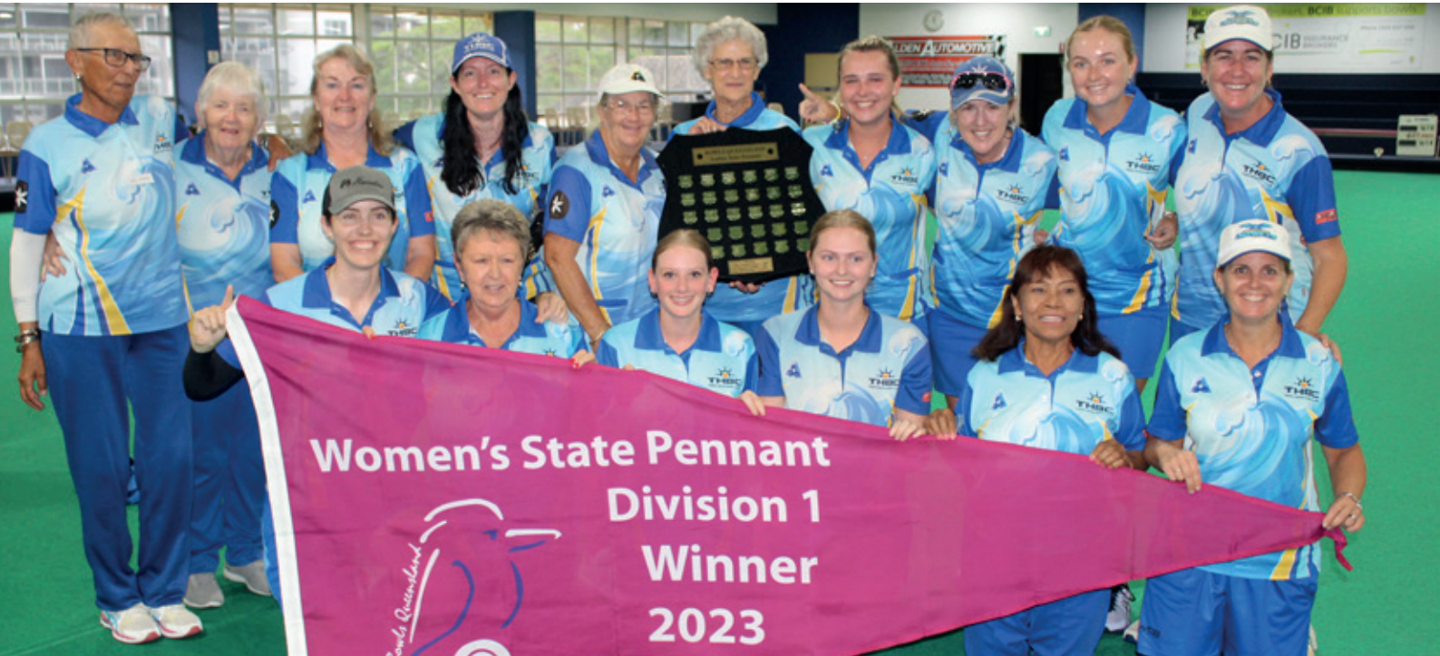
Pennant 2023 Division 1 Winners Club Tweed women