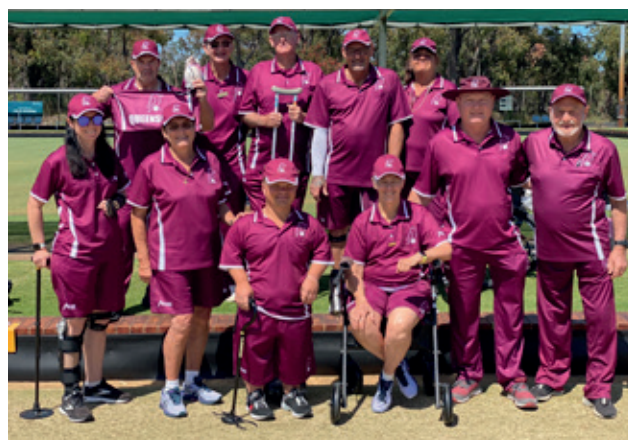
Queensland Para Team