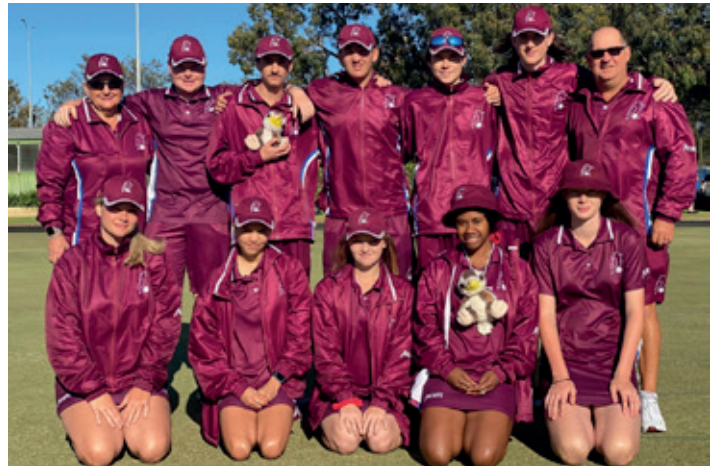
U18 Queensland Team