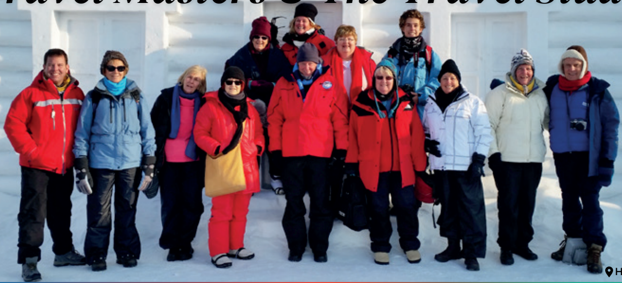
📍 Harbin Tour 2015