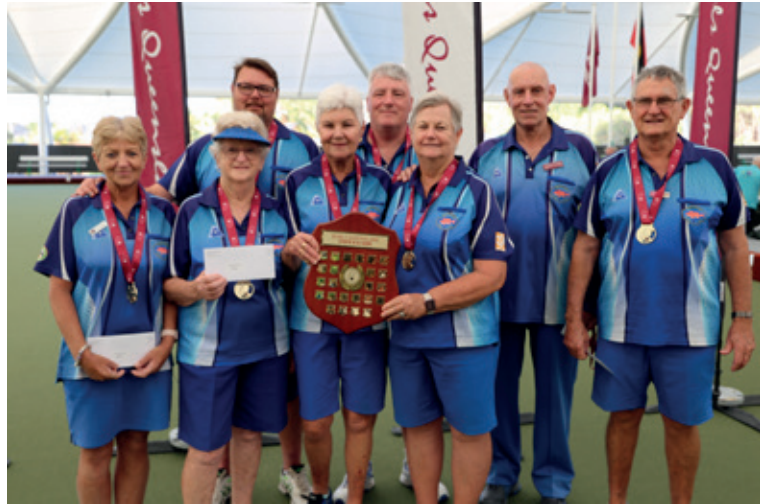
8 A-Side Winners Mooloolaba